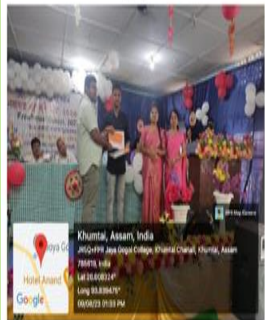
Probin Chandra Borah Memorial Award in Chemistry 2022-23