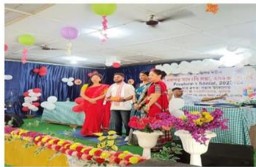
Best Graduate in Zoology Departmental Award 2022-23