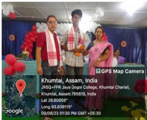
Best Graduate in Education Departmental Award 2022-23