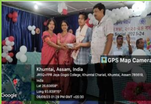
Best Graduate in Assamese Departmental Award 2022-23