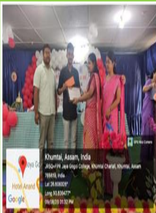
Best Graduate in Chemistry Departmental Award 2022-23